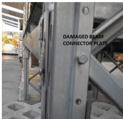
Figure 8: Damaged beam connector plate.