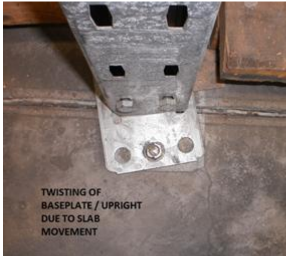
Figure 9: Twisting of baseplate.

Yielding and fracture of baseplates is a typical mode of failure. Sometimes down aisle shear forces at the baseplate twist the baseplate and the connected upright, as shown in Figure 9. An example of failure of the base plate connection is shown in Figure 10. Controlled yielding of the baseplate in a severe earthquake can be an intended mode of energy dissipation. In this case the baseplate should have been designed and tested for this mechanism and the manufacturer should be able to provide results for the testing. The specification for the tested baseplate should be available, so that the client can determine they have the same detail and materials. It is important that the baseplate is installed exactly as per the specification.