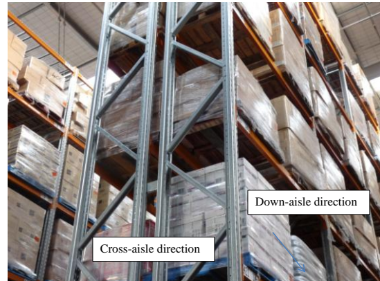
Figure 2: Typical pallet racking storage system.