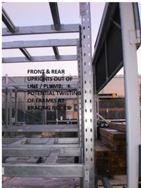
Figure 4: Out-of-plumb in front and rear upright members.

Also, out of plumb damage in upright members as shown in Figure 4 could result in possible twisting of the upright posts at bracing nodes and/or rotation of moment connections between the beams and the uprights.