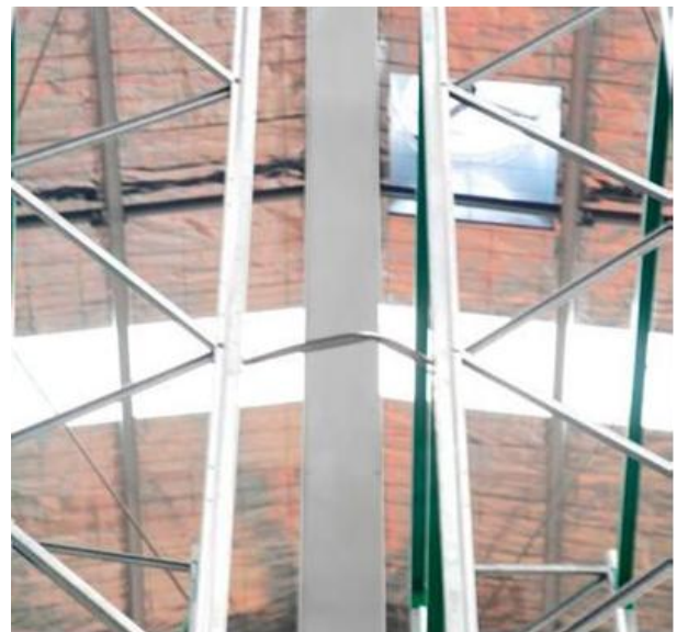
Figure 12: Evidence of damage to a racking system from impact on the adjacent building structure.

Storage racking is invariably designed to be free-standing without support from the surrounding structure. It is important that seismic displacements of the racking can be accommodated without impacting on the building structure. Apparently there is at least one instance where parts of a rack have impacted the building structure as in Figure 12. In this case, fortunately the rack did not collapse as a result of the impact. However, such impacts could easily alter the response of the racking system to the earthquake motion and introduce unexpected loads on the system. They could also introduce unexpected load on the building, which could cause it to fail.