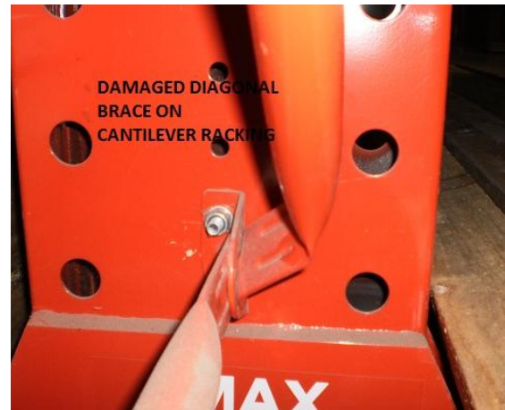
Figure 11: Damaged diagonal bracing elements.

Figure 11 shows failure modes in the bracing elements. It is advisable to replace buckled braces and check carefully for cracks in the supporting connection into the column wall and locally in the column wall itself.