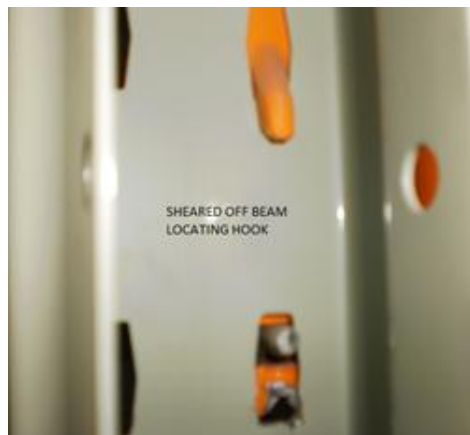
Figure 7: Sheared off beam locating hook.