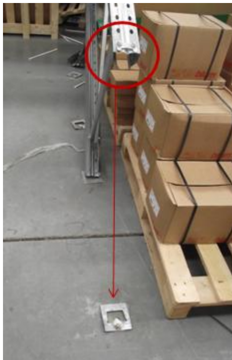
Figure 10: Failure of baseplate to upright post connection.