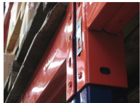
Figure 6: Beam end plate buckled.