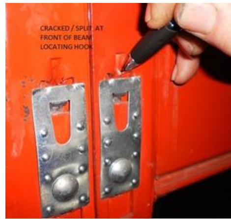
Figure 5: Cracked/split at front of beam locating hook.

The beam end connectors, safety clips and any other elements used to transfer beam moments are likely to suffer from any form of distress such as cracks in the parent metal, fractures in welds and possible loss of strength of connecting bolts (e.g. shear or bearing failure). Figures 5 to 8 illustrate possible failures in the beam connector elements.