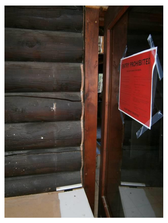
Figure 19: Localized sliding of logs.