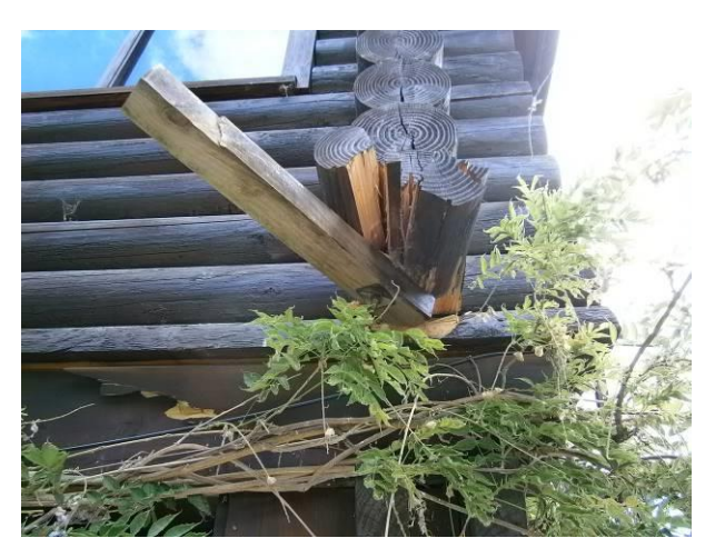
Figure 31: Crushing of bottom log.