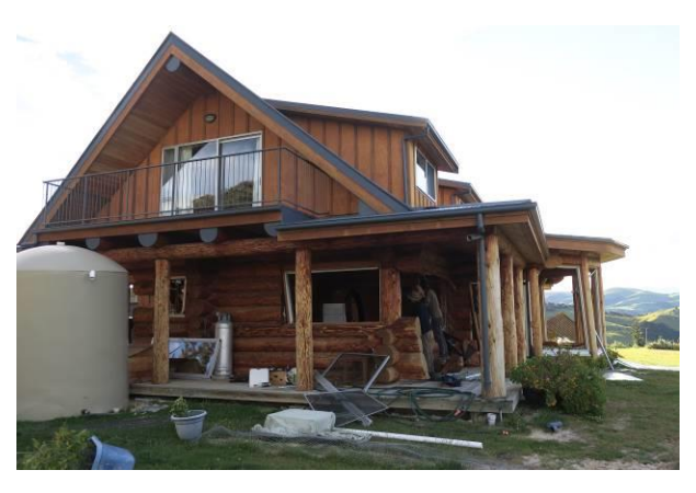
Figure 39: Two storey traditional log house with visible residual drift.