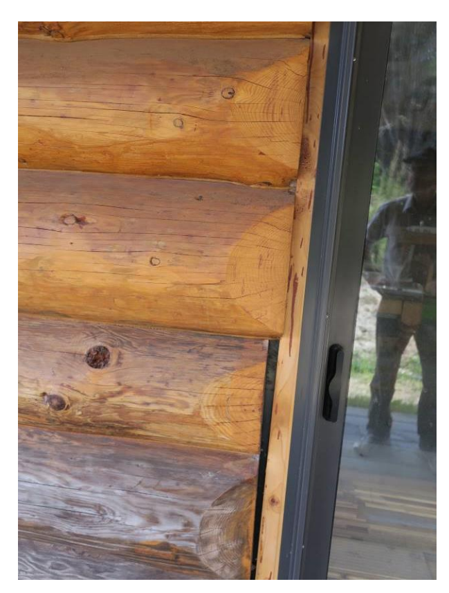
Figure 18: Localized sliding of logs.