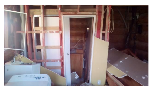
Figure 54: Typical damage to light timber framing walls lined with plasterboard.