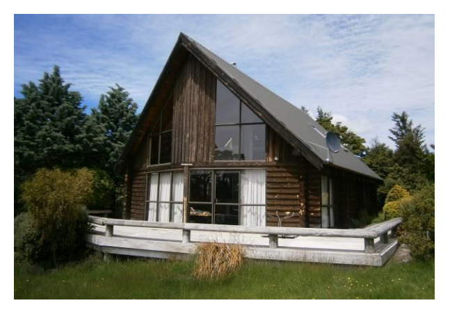
Figure 5: Two storey log house.