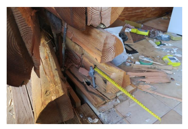
Figure 48: Splitting of logs weakened by tie rods and shear dowels.