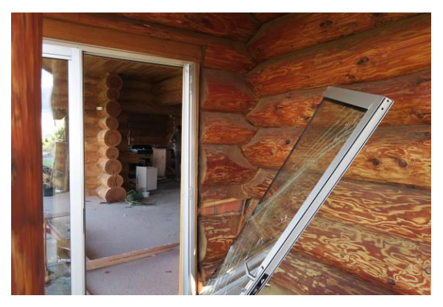
Figure 53: Typical damage to doors and windows due to large horizontal deformation.