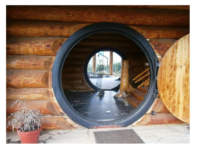
Figure 43: Large deformation around very stiff circular door frame.

Permanent deformations from horizontal sliding between logs was much larger in this house than in houses at Mt Lyford, as shown in Figures 41 and 42. There was unusual movement around the circular steel frame of the front door shown in Figure 43 where there was upwards movement of logs due to the shape of the door frame. The picture trapped under the bottom log in Figure 44 shows that there was significant vertical movement of some log walls.