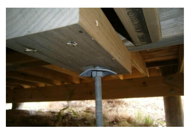
Figure 29: Bent washer and wood crushing in anchorage block.