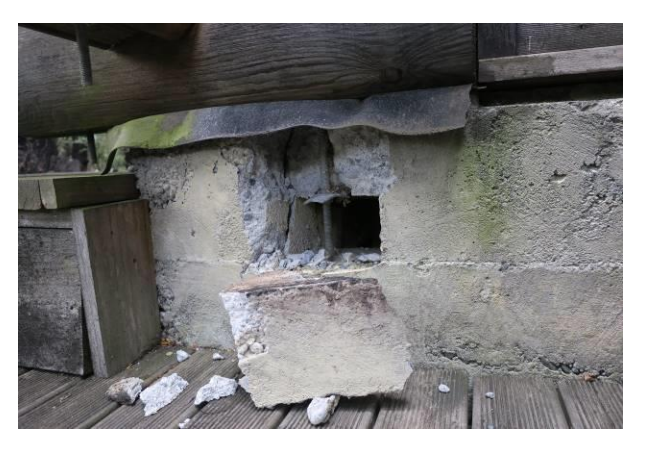
Figure 26: Damage to pocket in concrete foundation due to missing reinforcement.

In houses with timber floors, there were some fractures of the short timber anchoring block between double joists as shown in Figure 32. Reinforcement provided by one owner after the earthquake is shown in Figure 33.