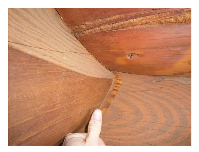
Figure 22: Sliding of the logs at corners.

Figure 23 shows 60mm horizontal sliding where the bottom end of the tie-down rod was sitting on the top surface of timber decking.