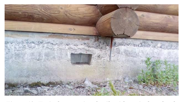
Figure 12: Typical connection details with vertical steel rods and anchorage into foundation and half log (sill log).

Structural design methods for most log houses are described briefly, as an introduction to the observations of earthquake damage. All walls are constructed with horizontal logs stacked on top of each other, with half-depth notches at the house corners to allow the logs to pass though the corner junction. This requires the bottom logs to be whole logs in one direction and half logs in the perpendicular direction as shown in Figure 12.