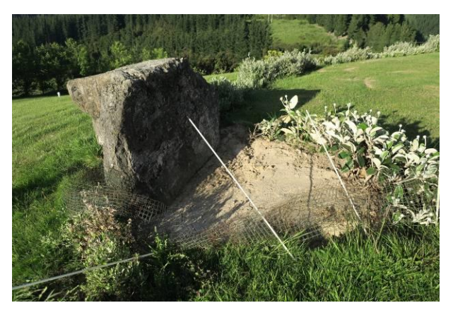
Figure 40: The rock close to the house was moved by about a meter by the earthquake.