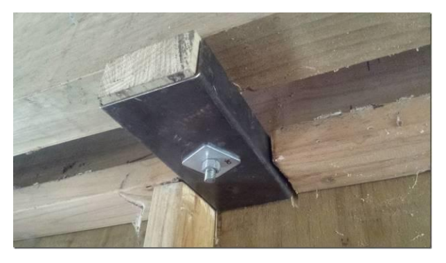
Figure 33: Reinforcement of timber anchorage with a steel profile.