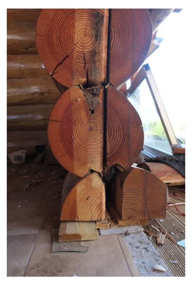
Figure 47: Splitting of bottom log.