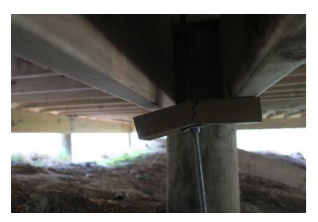
Figure 32: Failure of timber anchorage block.