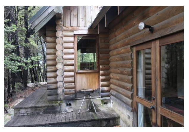
Figure 6: Two storey log house with slab on grade foundation.