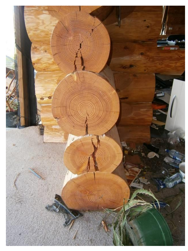
Figure 46: Initiation of splitting in logs, undamaged bottom log.