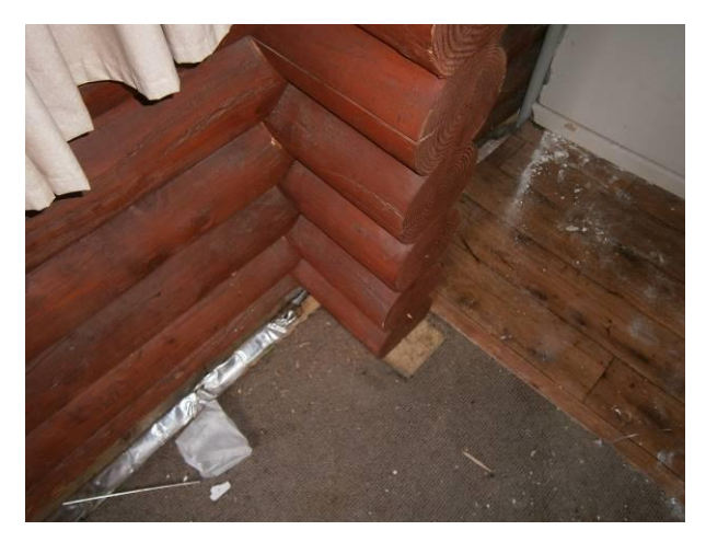
Figure 24: Sliding of the logs on suspended floor.