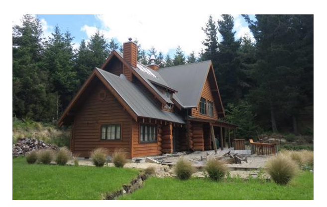
Figure 10: Two storey traditional log house with geotechnical damage.