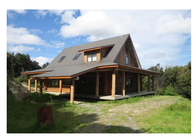
Figure 9: Two storey traditional log house.