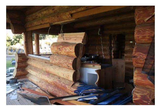
Figure 50: Wall stability failure and splitting of logs.