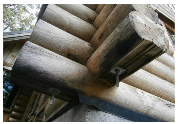
Figure 13: Typical connection with threaded rods through the logs.

For houses on concrete slab floors, the most typical hold-down detail is for the sill log (bottom log) to be anchored to the concrete slab with bolts or threaded rods. There are several different details for anchorage to the slab including epoxy, or washer and nuts in a pocket in the concrete or to a cast-in steel angle. It is typical for all the upper logs to be anchored to the bottom log with vertical threaded rods which pass through holes drilled in every log as shown in Figure 13.