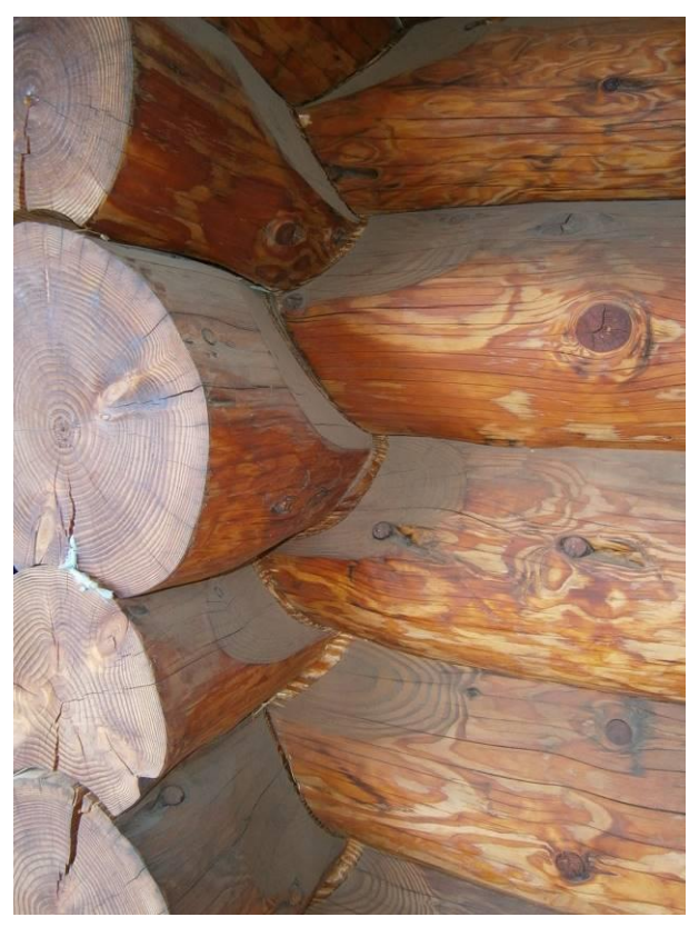
Figure 41: Permanent deformation in corner area.