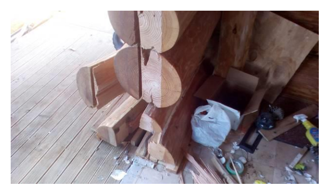
Figure 49: Splitting of bottom log weakened by vertical slot at door frame.