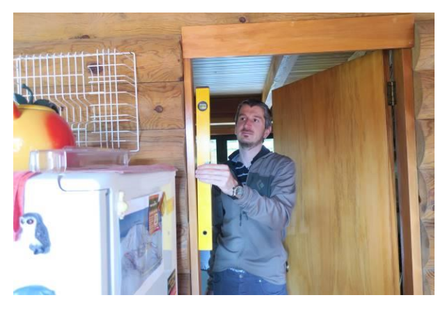
Figure 21: Sliding of logs resulting in residual drifts of the house.