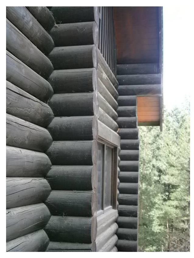
Figure 20: Sliding of logs resulting in residual drifts of the house.