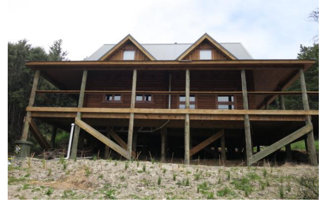
Figure 7: Two storey log house with pole foundation.