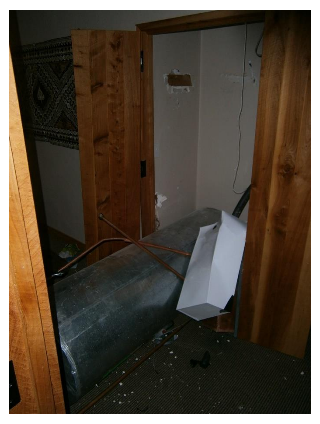
Figure 37: Damage from insufficiently restrained water cylinder.