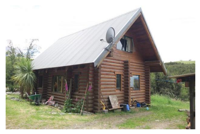
Figure 3: Two storey log house with slab on grade foundation.