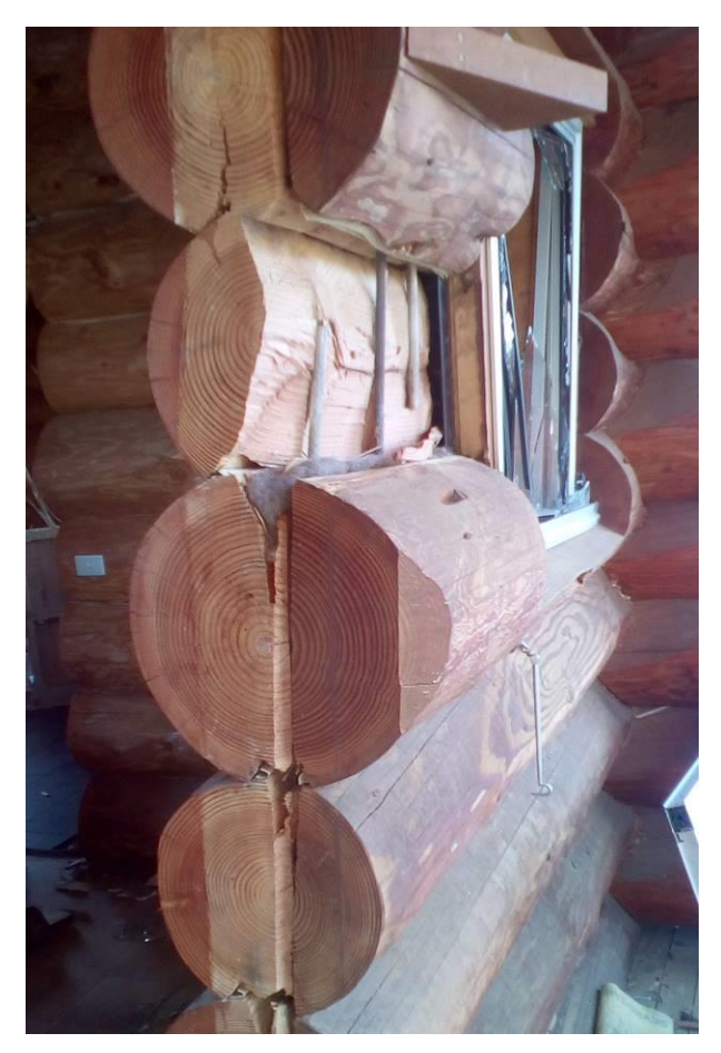
Figure 52: Splitting of log due to weakening by dowels, tie rod and vertical slot at door frame.