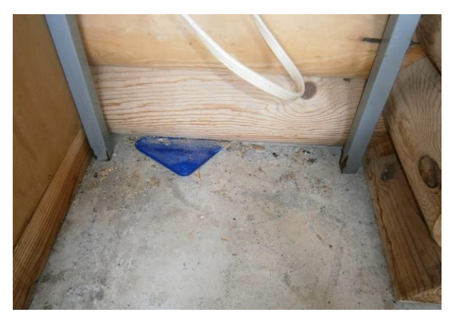
Figure 17: Ice-cream lid trapped under bottom log.