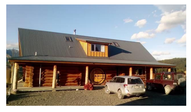
Figure 38: Two storey traditional log house.

The authors were directed to one particular log house about half way between Mt Lyford and Waiau, which suffered extreme near-fault shaking, leading to extensive damage. This house is described separately to the others because of the higher level of damage. It is a new house, of large traditional log house construction on a concrete slab, shown in Figures 38 and 39. An indication of the extreme level of local shaking is provided by the rock on the lawn shown in Figure 40, which jumped to a new position over one metre away. The damage to this house is considered to be the result of exceptional ground movement rather than any major deficiencies in the design or construction. Local acceleration amplification due to the local topography, also known as the 'hill crest effect' [9], could have caused the increased shaking of the house.