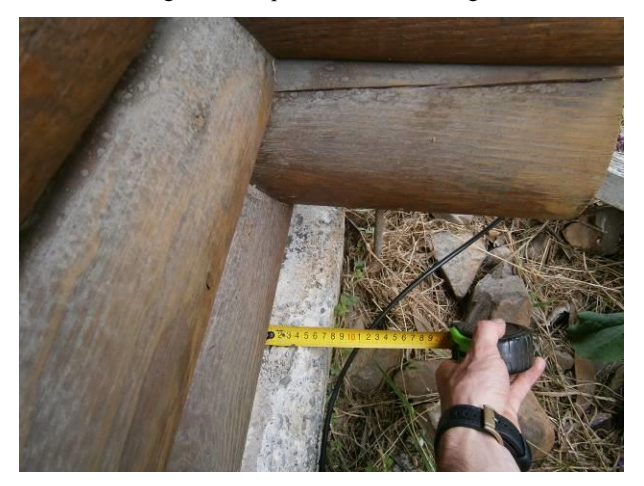
Figure 15: Horizontal sliding of the house.

In a few houses with poor anchorage, the whole house slid horizontally on the foundations, by up to 100mm. Figure 15 shows local sliding of the house in Figure 3. Sometimes the sliding was at the top of the bottom half-log as shown in Figure 16. In a few exceptional cases, objects were trapped under the bottom log, showing that there had been considerable upward movement of the whole wall for a few moments during the earthquake as shown in Figure 17.