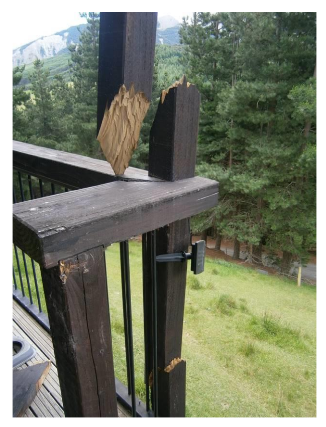
Figure 25: Fracture of veranda post due to excessive lateral movement.