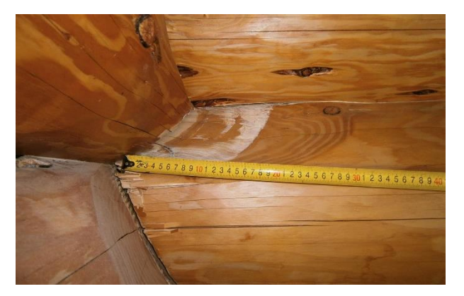
Figure 42: Permanent deformation in corner area.