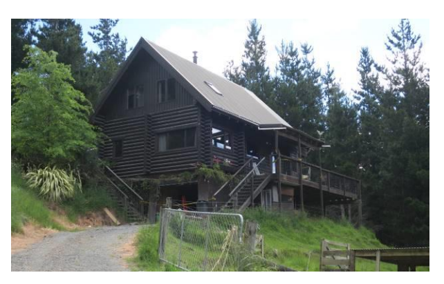
Figure 4: Two storey log house on slope with pole foundation.