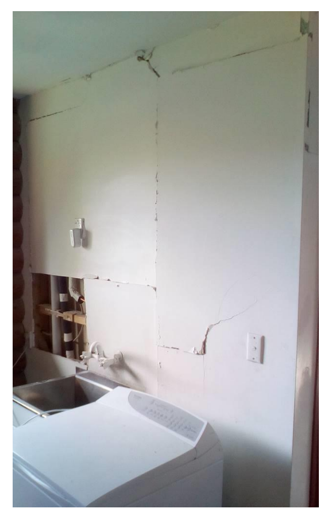
Figure 36: Typical cracking of gypsum plasterboard.