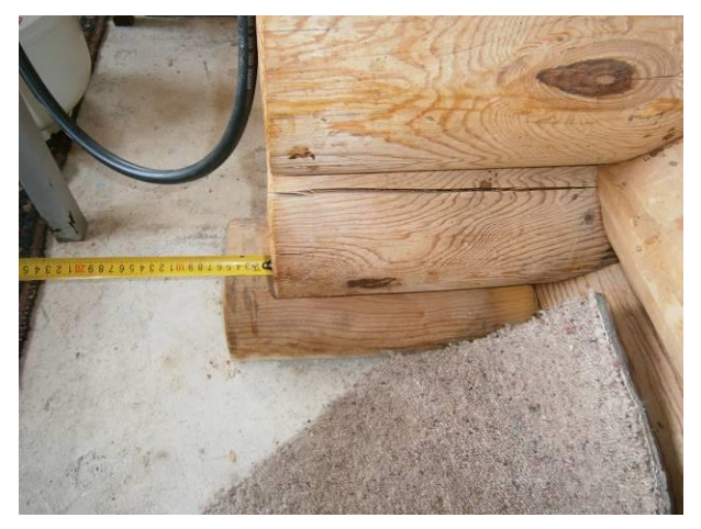
Figure 16: Sliding at the top of the bottom half-log.

corner connections, especially for hand-hewn connections in large irregular logs as shown in Figure 22.