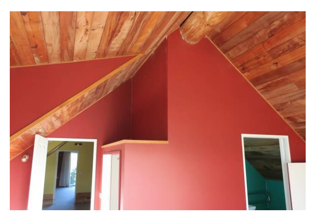
Figure 56: Damage in the upper storey was very limited.