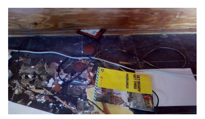
Figure 44: Trapped picture frame under sill log.

Permanent deformations from horizontal sliding between logs was much larger in this house than in houses at Mt Lyford, as shown in Figures 41 and 42. There was unusual movement around the circular steel frame of the front door shown in Figure 43 where there was upwards movement of logs due to the shape of the door frame. The picture trapped under the bottom log in Figure 44 shows that there was significant vertical movement of some log walls.