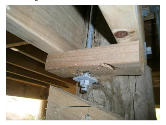
Figure 14: Typical anchorage with a timber block between floor bearers.

For houses on raised timber floors, the most typical detail is for the vertical rods to run full height from the top of the top log to the underside of the foundations. The bottom end of the rods is often anchored between double timber bearers as shown in Figure 14.