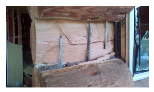
Figure 51: Splitting of log.