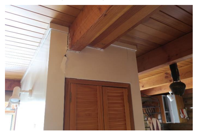
Figure 35: Typical cracking of gypsum plasterboard.

In a smaller number of houses there were broken windows or roof damage due to falling chimneys of unreinforced masonry. A few houses had broken windows and there were a small number with damage from falling chimneys.