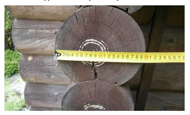
Figure 2: Typical machined logs.

geotechnical damage to the surrounding ground, which affected amenity and access, but not the main structure. A few houses lost support due to slope stability issues.