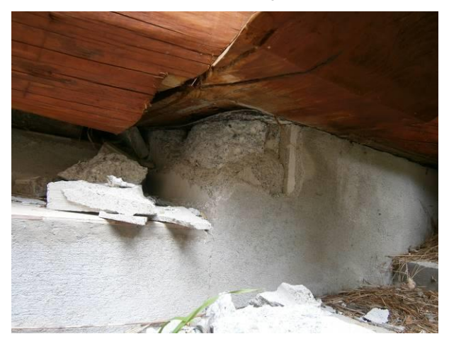
Figure 34: Cracking and spalling of concrete due to large compression forces.

Most foundations performed very well, provided that the land remained stable. There were a few exceptions such as cracking off of the corner concrete shown in Figure 34.