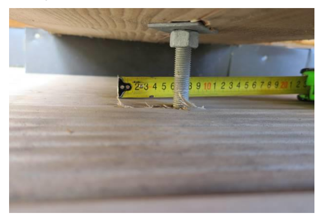
Figure 23: Sliding of the logs measured at the vertical rod.

In general, the machined notches in the houses with 200mm logs tended to provide greater resistance to sliding than the hand-hewn notches in the larger logs. More sliding between large logs may also have been due to the greater mass of these buildings.