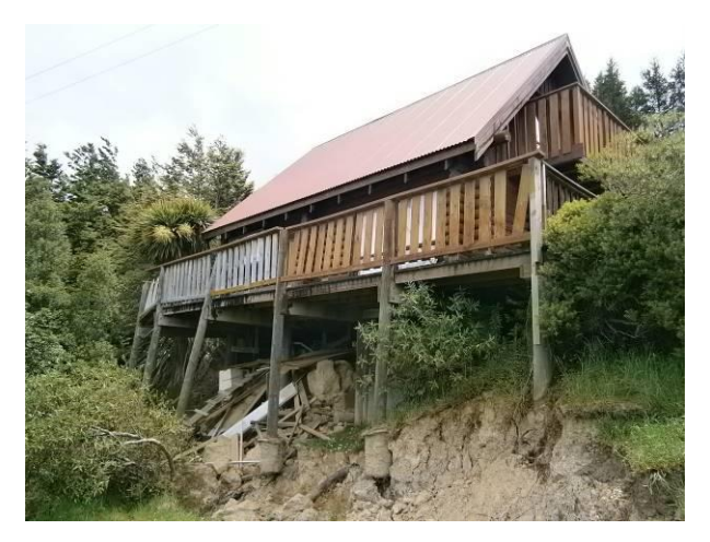
Figure 11: Two storey log house on slope with pole foundation with slope stability failure.