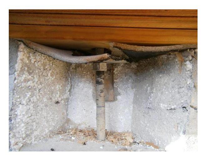
Figure 45: Yielding failure or fracture of tension rod.

Figure 45 shows yielding of tensile tie rods. Significant damage occurred at the bottom log connection to the concrete slab, especially where there was a bottom half-log. A typical undamaged whole log is shown in Figure 46, whereas Figures 47, 48 and 49 show severe splitting of bottom half-logs in the transverse direction. This splitting was accentuated by the presence of tie rods (to resist uplift), dowels (to resist shear) and pre-cutting of logs at door and window opening to control shrinkage.