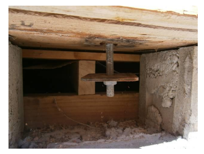
Figure 27: Fractured tie rod.