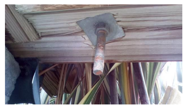
Figure 30: Bent washer and wood crushing in bottom log.