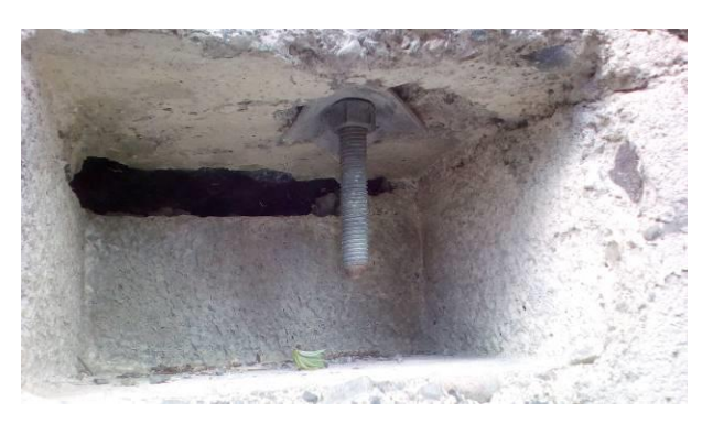
Figure 28: Bent washer in concrete pocket.