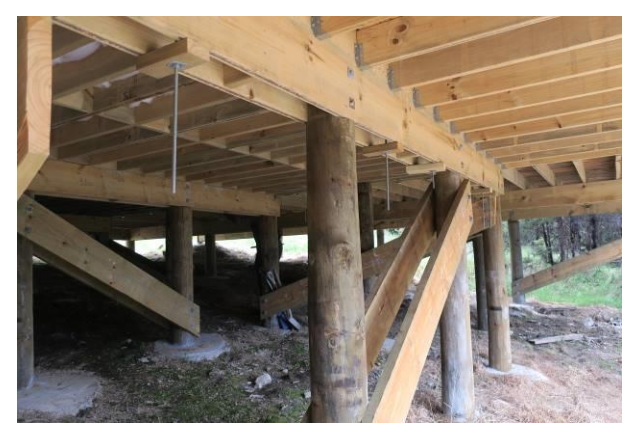
Figure 8: Pole supports with diagonal sub-floor bracing.