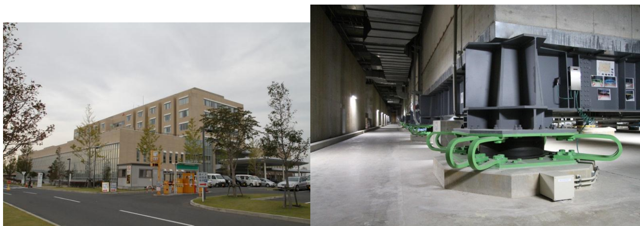
Figure 3: Ishinomaki Red Cross Hospital [left] and detail of the seismic isolation devices (rubber bearings coupled with U-shaped steel dampers) [right].

This earthquake started at 2:46pm and strong shaking lasted for more than 2 minutes - keep that time in mind as you watch the video. The first minutes show the actual shaking, whilst the remainder is the immediate response of the facility and staff to the impending arrival of victims; quite simply, one of the most compelling (video) testaments to the benefits of base isolation technology. Notice that the facility is fully operational after the earthquake, with little or no damage to the facility; exactly the performance expected from our hospitals and other critical buildings.