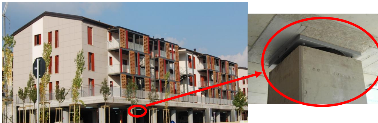
Figure 1: Examples of base isolated building in L'Aquila [left] and close view of the Friction-pendulum seismic isolation units [right].

completed) design and build many isolated projects each year, with a high proportion of these projects being for housing and commercial buildings. Recently, base isolation has been used in Italy for reconstruction following the L'Aquila earthquake of April 2009 (Calvi 2010) as shown in Figure 1.