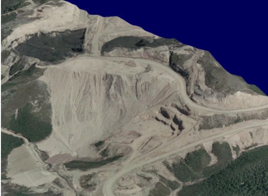
Figure 2 - Aerial view of the existing Mt Frederick Sidecast

The sidecast contains approximately 3 million cubic meters (m 3 ) of materials that were end-tipped into an area on the northeast face of Mt. Frederick and the upper Herbert Stream catchment. Below the sidecast, a sediment retention dam was constructed to control and divert stormwater and sediment runoff from entering Herbert Stream. A recent aerial photo of the sidecast is shown in Figure 2.