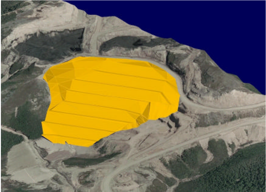
Figure 3 - Computer-generated view of proposed reconfigured sidecast.

The intent of preliminary layouts was to make the reconfiguration a balanced cut to fill operation and retain all of the overburden materials within the Herbert Stream catchment. However, it soon became apparent that this would not be possible without placing a significant quantity of materials on the potentially liquefiable sediments. Analysis of the liquefaction potential using methods by Seed and Davis & Berrill confirmed the susceptibility of the saturated sediments to liquefaction at the OBE level of shaking, therefore any material placed on the sediment was likely to be severely disturbed during seismic shaking. Other treatment options (such as densification, drainage, etc.) were investigated, and found to be prohibitively expensive for the scale of the site, the decision was made to place as little of the reconfigured stockpile on the impounded sediments as possible. Solid Energy agreed that a large volume of materials would have to be removed from the Mt Frederick site to achieve this goal. The proposed remedial earthworks will consist of flattening and recontouring the sidecast to create a stepped landform by a series of 10m wide benches spaced on 15m vertical intervals with 2.7H:1V batters slopes to produce an overall slope of 3.3H:1V as shown on figure 3.